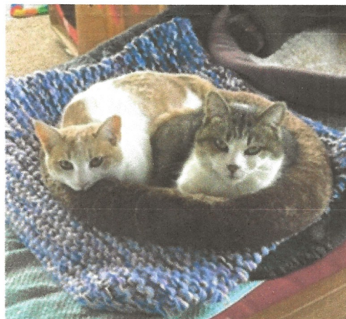
Cats at Our Farm Sanctuary enjoying a pet blanket made by our group.